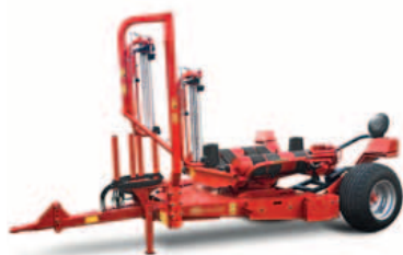
Vicon BW 2600 Turntable wrapper, trailed Max bale size: 1.20x1.50m

Vicon bale wrappers have been designed to offer fast and accurate wrapping of your precious forage crops. An investment in a Vicon bale wrapper is your guarantee of cost effective bale wrapping.