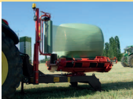
Bale and wrap counter is standard.