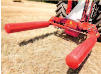
Easy and gentle self-loading of the bales – the bale is gently lifted by the rollers.