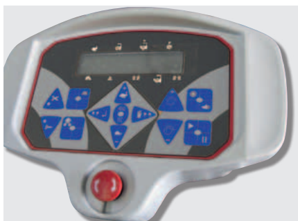
Monitor for the programming and control of the full wrapping cycle ...