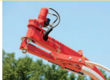
Strong satellite driveline.