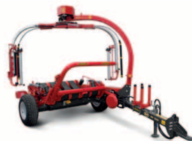
Vicon BW 2850 Satellite wrapper, trailed Max bale size: 1.20x1.50m