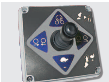
... and mini-joystick controlling the main functions.