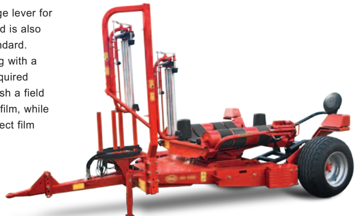
DuoWrap twin film pre-stretcher.

A simple ratio change lever for the table roller speed is also incorporated as standard. This allows wrapping with a single film where required – for example to finish a field off using one roll of film, while maintaining the correct film overlap.