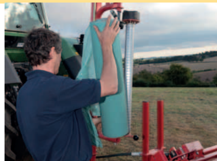
Easy change of film roll.