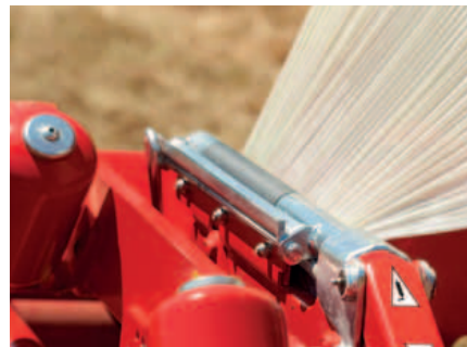
Hydraulic Film Cutter.