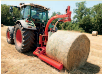
Self-Loading of bales – The BW 2250 has a self-loading mechanism to gently load and unload the bales.