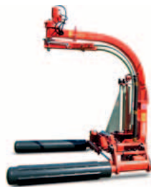
Vicon BW 2250 Satellite wrapper, mounted Max bale size: 1.20x1.50m