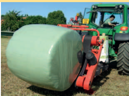
Low table height for fast and gentle unloading.