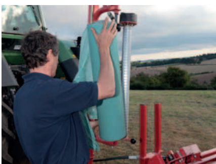
Easy change of film roll.

Low lifting height of the film rolls is achieved thanks to the low profile design of all Vicon bale wrappers.