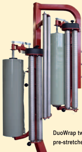
DuoWrap twin film pre-stretcher.