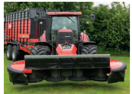
The entire front can be opened for maintenance purposes.