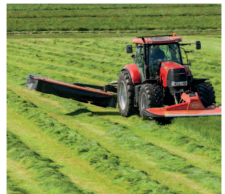
Ample clearance to protect swaths from damages during headland turns.