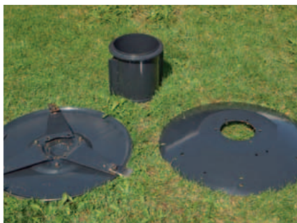
The drums are divided into several sections.