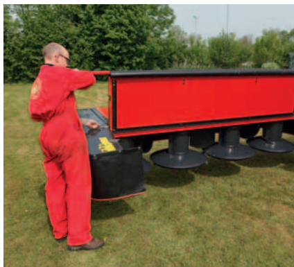
The complete front can be lifted for easy access to the drums.