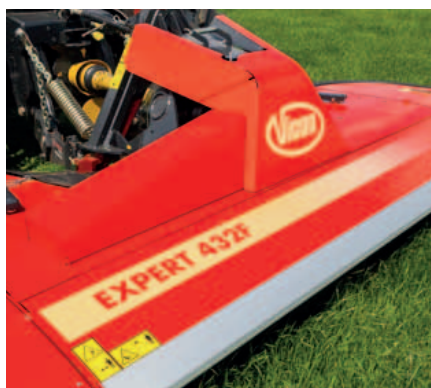
Automatically adjustable v-belt drive.