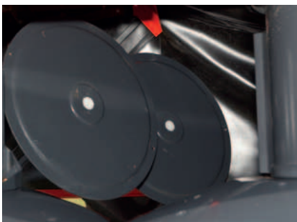
Swath discs fitted to provide narrow swaths.

Our aim is to let you make the most of your time. This makes easy maintenance an important aspect. For service the complete top of the drum can be removed and each drum is divided into several sections for easy and cost-efficient replacement of parts.