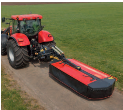
EXPERT 431 is transported in a horizontal position behind the tractor.

As the PTO angle is constant during headland turns, vibrations in the transmission are eliminated, implying less wear on tractor and machine.