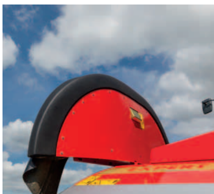
The next generation FlexProtect, made from highly flexible and durable polythene effectively absorbs any strain subjected to the side covers.