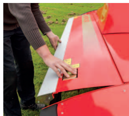
All handles used for daily operation are clearly visible and easily accessible for maximum ease-of-use.