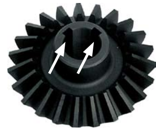
All gears have integrated double keyways for extended life span.