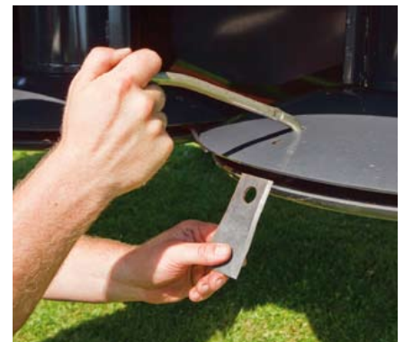
Knives are easily changed using a special handle. Simply push down and knives are released.