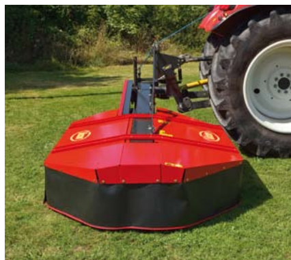
... is done without leaving the tractor cab.