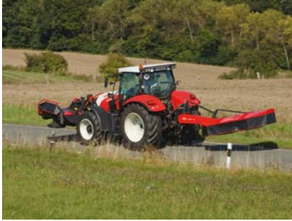
Machine is set to horizontal transport position without leaving the tractor.