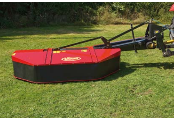
Going from transport to working position...

This system ensures that the crop is kept away from the drums, reducing wear and