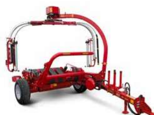
Vicon BW2850 Satellite wrapper, trailed Max bale size: 1.20x1.50m