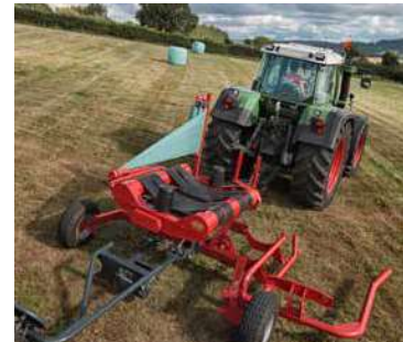
Turntable with two driven rollers designed for a high bale stability and smooth even rotation.