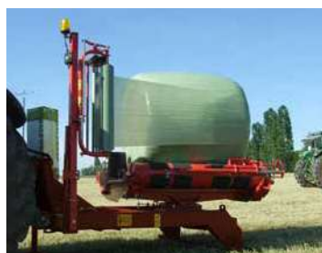
Bale and wrap counter is standard.

“ Optional remote control – for easy handling”