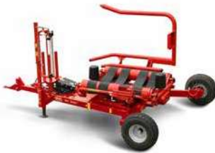
Vicon BW2400 Turntable wrapper, trailed Max bale size: 1.20x1.50m