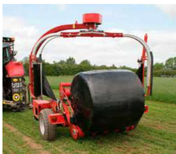
Fast and gentle unloading of bales with no need for a drop mat.