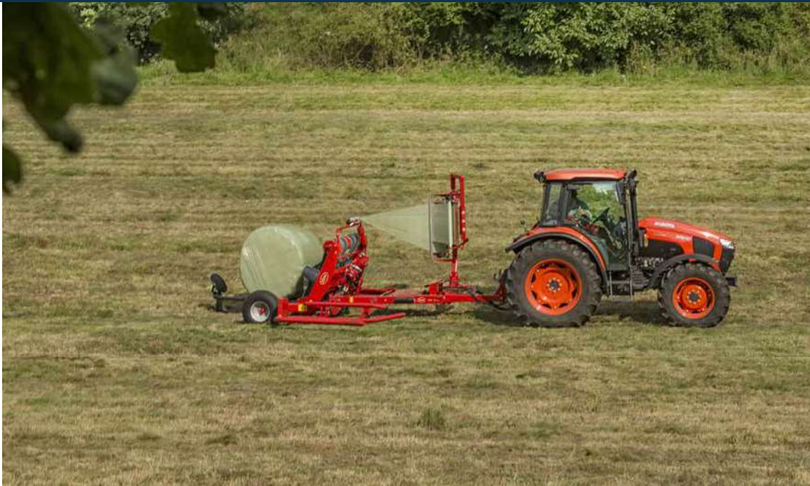
The loading arm is powered fully down to lift the wheel off the ground for easy movement from work to transport.