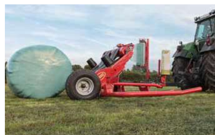
Low design of the machine ensures fast and gentle unloading of the bale.