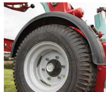
Mud guards reduce mud and dirt building up on the pre-stretcher and film rolls when operating in soft ground field and during transport.