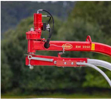
Strong satellite driveline.