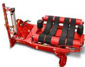
Vicon BW2100 Turntable wrapper, mounted Max bale size: 1.20x1.50m