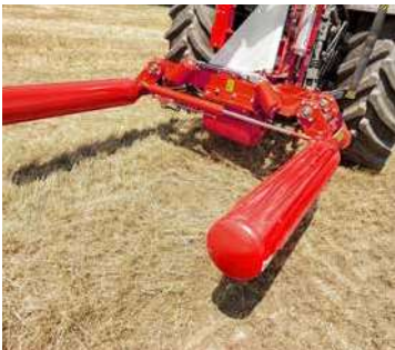
Easy and gentle self-loading of the bales – the bale is gently lifted by the rollers.