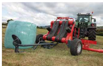
The Vicon Turntable wrappers can be fitted with a bale on end kit.

The wide spacing of the wheels has allowed an exceptionally low mounting position for the turntable. This allows the table to be tilted downwards until it nearly touches the ground, reducing drop height when unloading bales, ensuring the gentlest possible handling of the wrapped bale. This reduces the chance of film damage and eliminates the need for a fall damper or drop mat in normal conditions.