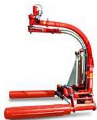
Vicon BW2250 Satellite wrapper, mounted Max bale size: 1.20x1.50m