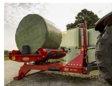
Able to handle round balers up to 1200 kg.