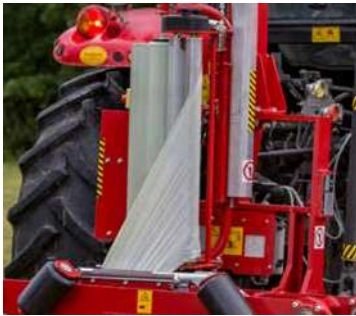
Hydraulic film cutter.