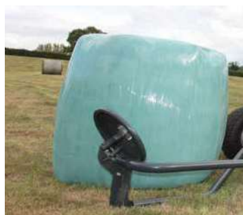
The Vicon BW2850 can be fitted with a bale on end kit.