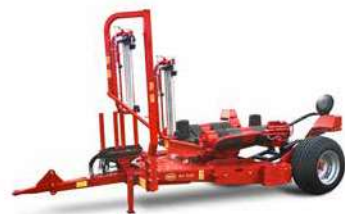
Vicon BW2600 Turntable wrapper, trailed Max bale size: 1.20x1.50m