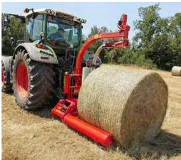
The BW2250 has a self-loading mechanism to gently load and unload the bales.